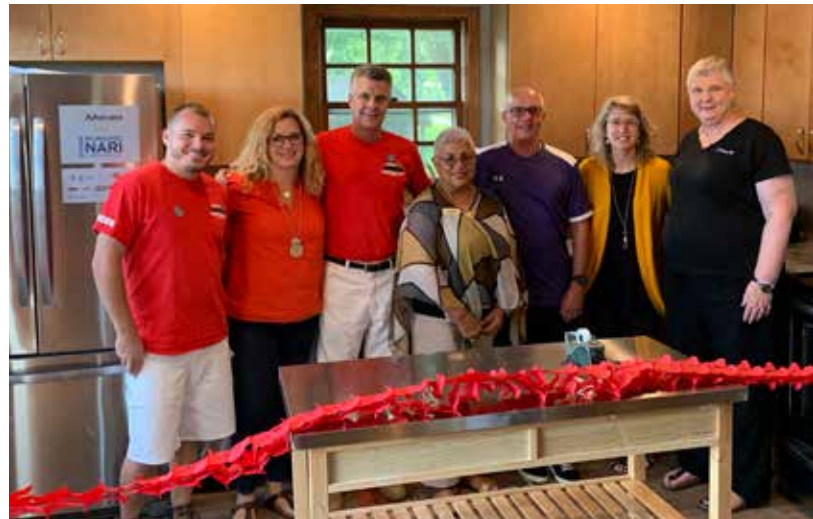
Pictured: Ribbon cutting for one of the Foundation's community projects; a kitchen remodel for Advocates of Ozaukee, a local womens shelter.

The Foundation's scholarship and grant program financially assists Wisconsin-based students and educational institutions. Students participating in a recognized trade-related program at a Wisconsin institution can apply directly through the Foundation. Locally, Milwaukee Area Technical College (MATC) and Waukesha County Technical College (WCTC) students participating in a recognized trade-related program can